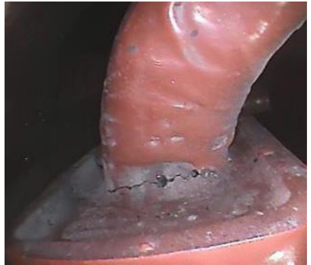
Crack on endcap

With all test results meeting acceptable limits, Quartzelec certified the unit as fit for service. To ensure ongoing reliability, continuous PD monitoring was recommended using the LIFEVIEW PDA II on the generator winding.